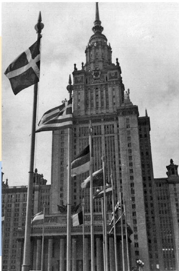
Figure 3: The flags of the participant countries at the Moscow General Assembly of the IAU (1958) in front of the Moscow University.

Then I proposed a different project, namely to have every year a large local meeting in Europe, under the auspices of the International Astronomical Union. This idea was quite successful and the first European Meetings took