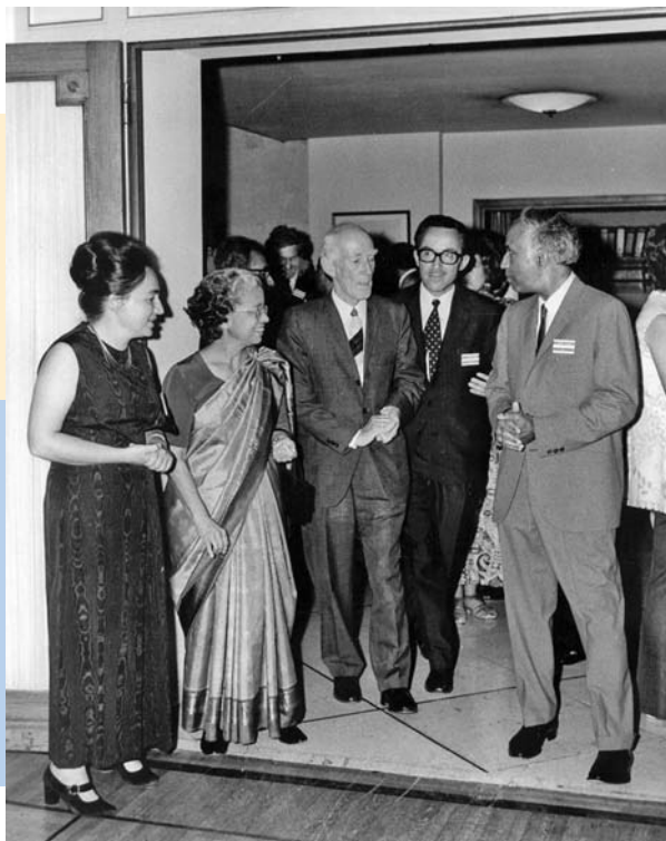
Figure 4: The first European Meeting under the auspices of the IAU in Athens (1972). We see Prof. Chandrasekhar (Nobel prize) [right] and Prof. Oort [center].

place in Athens (1972) and Tbilisi, Georgia (USSR) in 1975. Later on, there were many similar "Continental" Meetings not only in Europe but also in Asia, in Australia-New Zealand, and in Latin America.