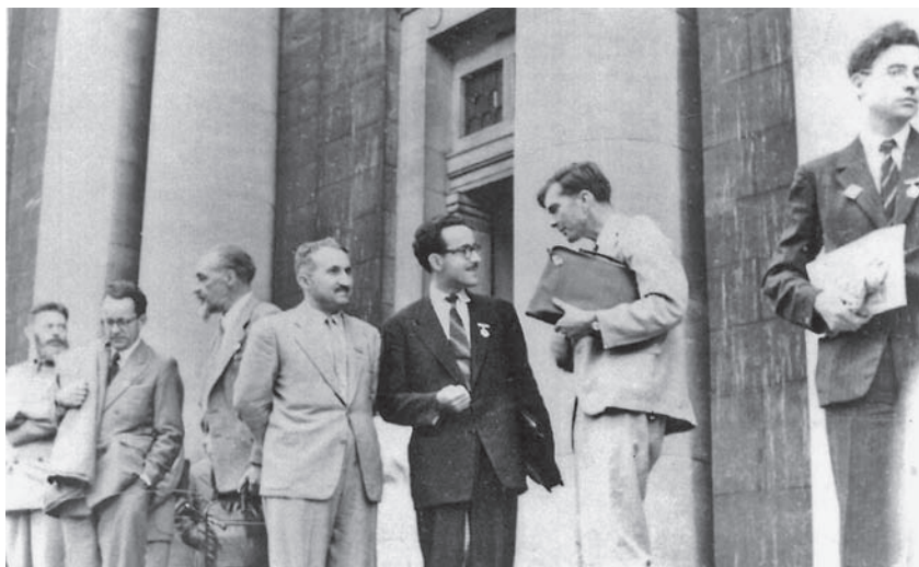
Figure 1: General Assembly of the IAU in Dublin (1958). Talking with Prof. Ryle (Nobel prize).

namics etc. The General Assemblies give us a unique opportunity of contact with astronomers from all around the world. The most important result of these contacts for me, was the invitation by Prof. Lindblad (Fig. 2), to go for one month in Stockholm, the following year. I met also